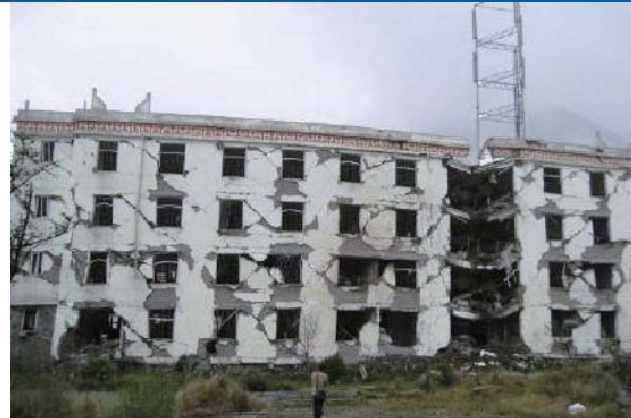
Photo 5: The Sichuan Earthquake of May 2008 left millions homeless.

On May 12, 2008, at 2:28 p.m. local time, a strong earthquake with a magnitude of M 7.9 occurred, its epicenter in Wenchuan county in the Chinese province of Sichuan. The quake killed 69,185 people, with 374,171 injured and 18,404 missing. Among the 23,143,000 residential houses hit by the quake, 6,525,000 collapsed (photo 5). Masonry buildings were particularly hard hit. The Building Research Institute took swift action, accepting seven Chinese trainees