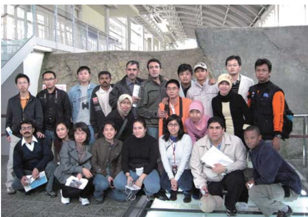
Photo 2: Trainees visit the Nojima Fault Preservation Museum in Awaji-shima island, Hyogo Prefecture.

On December 26, 2004, at 00:58:53 UTC, a massive earthquake with a magnitude of M 9.1 struck, its epicenter off the northwestern coast of Sumatra near the Andaman Islands. It triggered a series of tsunamis that traveled over the Indian Ocean to claim more than 220,000 lives in coastal countries. It was the worst tsunami disaster in history. Experts commented that the lack of development of the tsunami warning systems in the Indian Ocean coast region and a lack of public knowledge about tsunamis were among the reasons for the extensive damage. Data demonstrate the estimated times required from occurrence of the earthquake to the arrival of the waves at different locations. The data are based on a numerical simulation. This reveals that there were a couple of hours until the tsunami hit some countries remote from the epicenter zone, especially in Thailand, India and