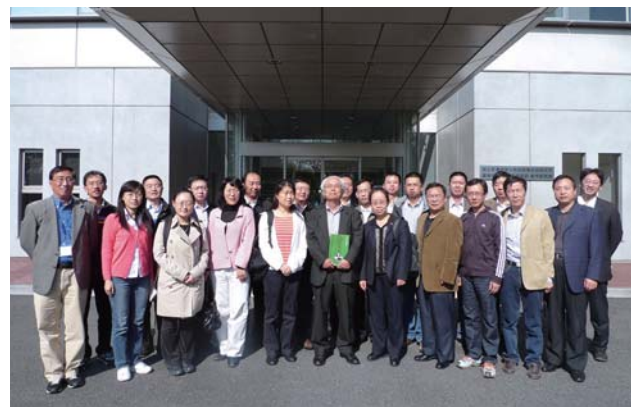
Photo 6: Trainees on the China Seismic Building Course following the first lecture of the 2009 term at the Building Research Institute

for the Seismology Course and the Earthquake Engineering Course under the annual international training in seismology and earthquake as part of its assistance in post-earthquake reconstruction (photo 6).