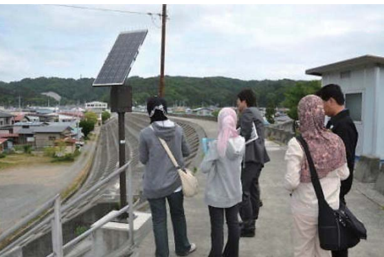
Photo 3: Trainees visit facilities for tsunami disaster prevention in Miyako City, Iwate Prefecture

The objectives of the course are to help the trainees acquire advanced knowledge and skills relating to earthquakes and tsunamis through training in the field of tsunami disaster mitigation policies and to develop people capable