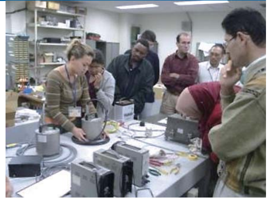
Photo 7: Participants on the Global Seismological Observation Course receive practical training in the use of seismometers.

The Internet-based Information Network of Earthquake Disaster Prevention Technologies (hereinafter referred to as “the IISEE Net” [ http://iisee.kenken.go.jp/ ]) has been established. It offers Web access to a wide range of technical information on earthquake disaster mitigation for buildings to the public. At present, it has technical information for ninety-one countries, most of which are developing nations. The information covers the earthquake observation network, the strong motion observation network, the seismic damage history, the quake-resistant building standards and examples of micro-zoning. The information available on IISEE Net is updated each year on the basis of data received from trainees. The IISEE Net has been equipped with the Earthquake Damage Estimation System for Buildings (EDES-B), which proposes the methodologies and steps required for estimating earthquake damage in the form of a list on the website, from which developing countries can select a method. It also seeks to offer information to developing countries in multifarious ways, for instance, by preparing lecture notes for training